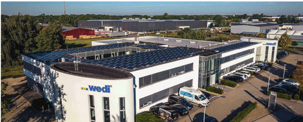
The wedi corporate headquarters in Emsdetten

Schedules at construction sites are tight, and staffing levels in many companies are low. The new Sanwell shower wall module is an ideal solution to this problem: cold and hot water pipes, the Hansgrohe iBox as well as all other connections are integrated into this module. The entire system is fully waterproof when arriving to site.