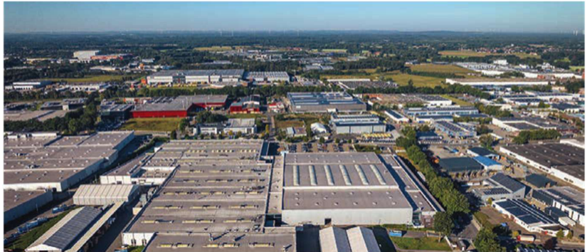
The wedi production facility at the company headquarters in Emsdetten